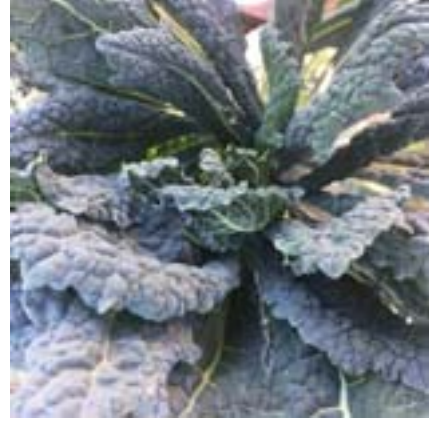
Dinosaur lacinto kale can be grown all year.

Fall is considered a time to slow down, seek serenity, and soothe the sores of summer. It's a time of color changes, chillier temperatures and cooler temperaments. Most of all, we rejoice the fruits of our toils. October has also been a premier month for earthquakes, fires and financial failures. Be prepared as this fact is not a myth. .... continued on Page D12