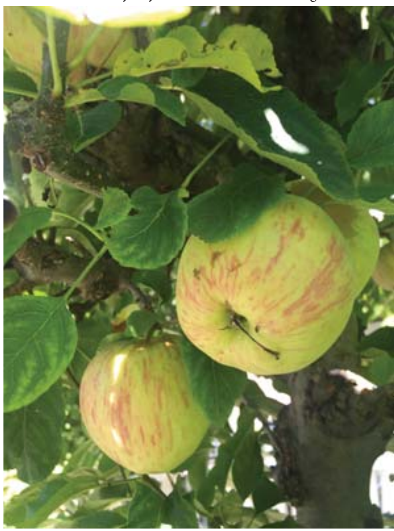
Apples are ripe and ready. Bobbing for apples was a game begun because of the goddess Pomona.

"Delicious autumn! My very soul is wedded to it." - George Elliot